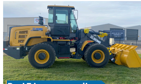
Real 3 tonne capacity