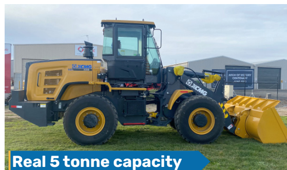
Real 5 tonne capacity